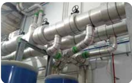
FABRICATION & INSTALLATION OF CHILLED WATER PIPELINE SYSTEM & PIPE SUPPORTS

Energy Tec has been at the forefront of technology and the design of solutions that work, producing complex products that are cutting edge and cost-effective as well as simpler designs for a wide range of clients.