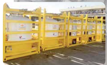
FABRICATION, BLASTING, PAINTING OF CHEMICAL TANKS