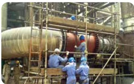
PLANT SHUTDOWN & MAINTENANCE ACTIVITIES