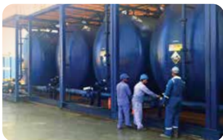
MAINTENANCE OF CHEMICAL TANKS