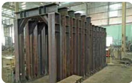
FABRICATION & INSTALLATION OF PIPE SUPPORTS