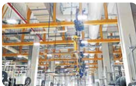
DESIGN, FABRICATION & INSTALLATION OF MONORAIL CRANE 10 TONNE