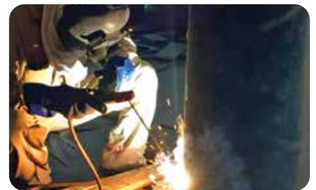
WORKSHOP WELDING OF PIPE SPOOLS

YOUR RELIABLE PARTNER FOR INDUSTRIAL SUPPORT SERVICES