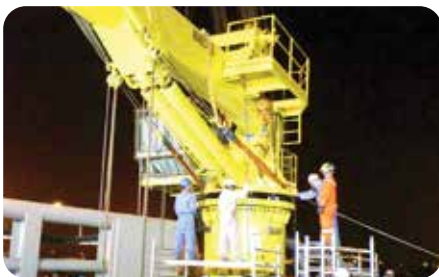
INSTALLATION OF DECK CRANE ONBOARD VESSEL