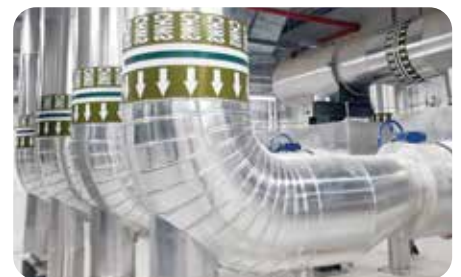
FABRICATION & INSTALLATION OF CHILLED WATER PIPELINE SYSTEM & PIPE SUPPORTS