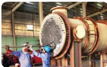
RE-TUBING OF HEAT EXCHANGER FOR CHEMICAL PLANT