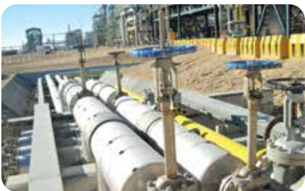
LIQUID NITROGEN EXPORT & IMPORT LINE SS316L